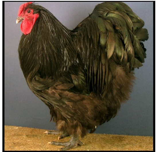
An example of a rose comb Orpington from Germany.

So I had these four lovely pullets and in all my time I have never bred with pullets and was not about to start, and did we want to add new blood to our old strain? But we had to do something with such a gift and I did not want to risk potentially losing those pullets through a hot summer with nothing to show for it. So the easiest way to keep the 2 strains separate was to put a Rosecomb onto these Ford Orpingtons, and that is what has been done.