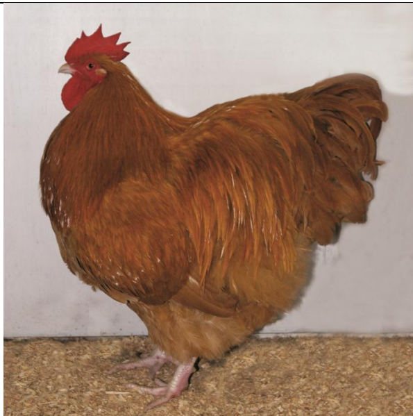
Figure 7 Ch Large Buff -Simon Bevan Cockerel