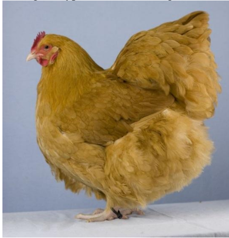
Goldfeather Poultry's RES Ch Large Orpington ( & Ch Large Buff -Pullet)

The winning Ckl a top fowl but just a little long in the back. The other ckls all had faulty wings! Females had some good type but all had bad ground colour with many bleached from too much sun exposure.