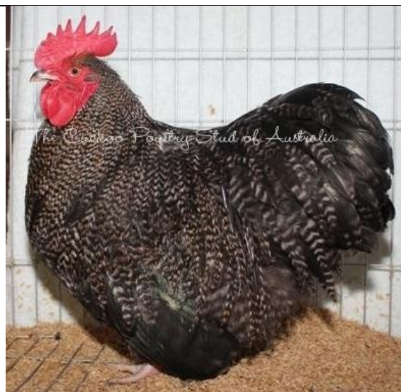
Figure 37 Res Ch Bantam Cuckoo- The Cuckoo Studs Cock

Patrons – Rob Lavender, Will Burdett (UK)