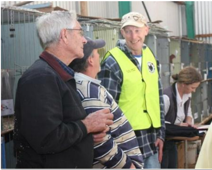
Figure 15 Laughing about the time spent in a car to get to a show at the Southern Feature Show