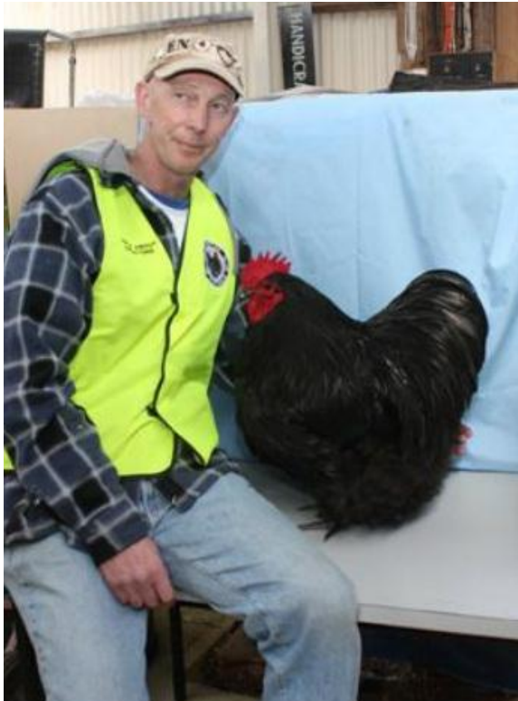
Figure 17 A proud Dad with the Champion Orpington at the Southern Feature Show