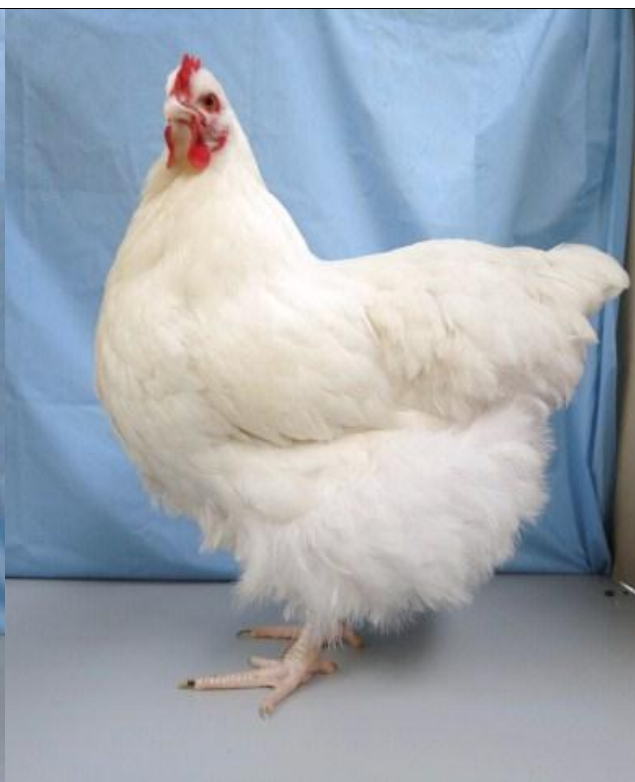
Figure 27 res Ch Large White- Waninga Orpingtons Pullet