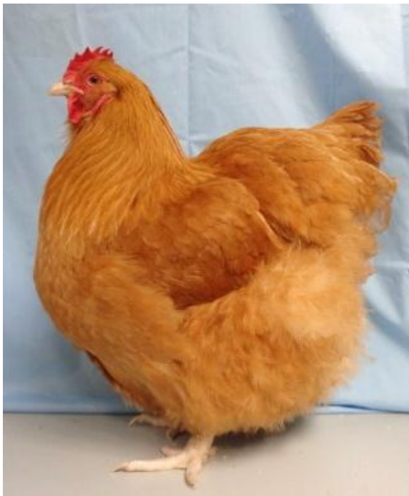
Figure 21 Ch Large Buff- Judy Witney Pullet