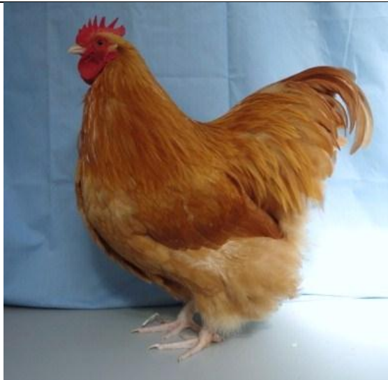
Figure 30 Ch Buff Orpington in Show, Ch Bantam- Bill Patterson Cockerel