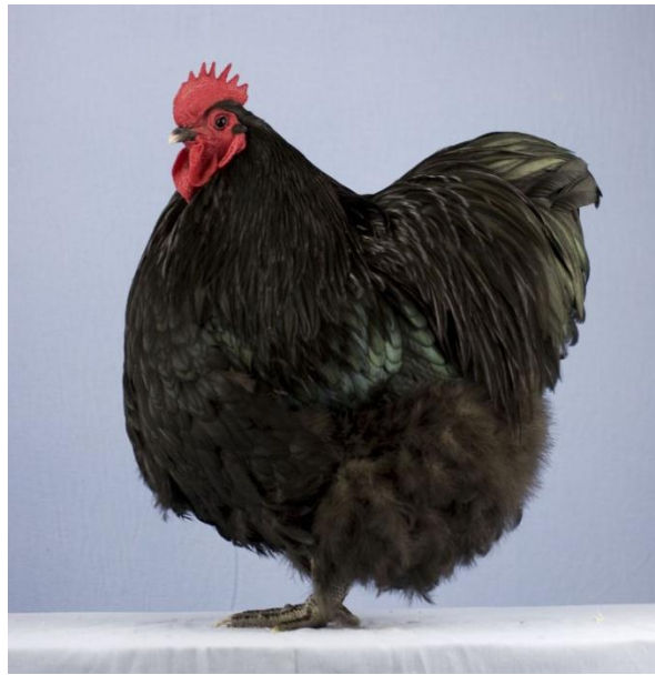
Waninga Orpingtons Large Black Cockerel ‘Caesar’

Autumn Newsletter 2012 The Australian Super Show Special