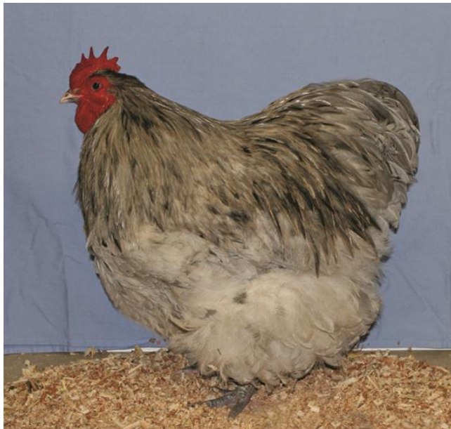
Figure 11 Ch Large Splash- Chris Hardman Cockerel