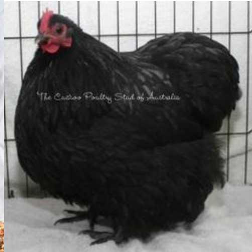
Figure 2 Ch Bantam in Show & Ch Bantam Black- the Cuckoo Studs Pullet