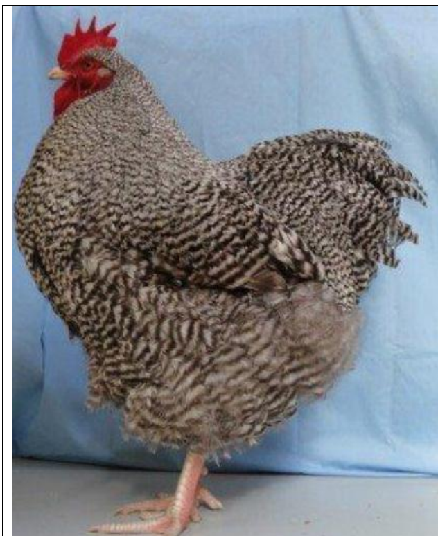
Figure 24 Ch Large Cuckoo- Waninga Orpingtons Cockerel