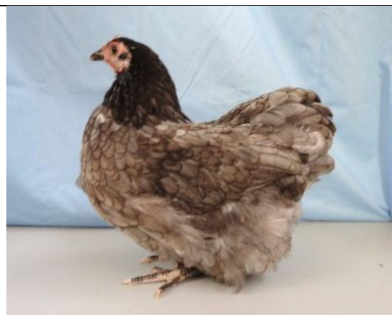
Figure 35 Res Ch Bantam Blue- Rob McLaren Pullet