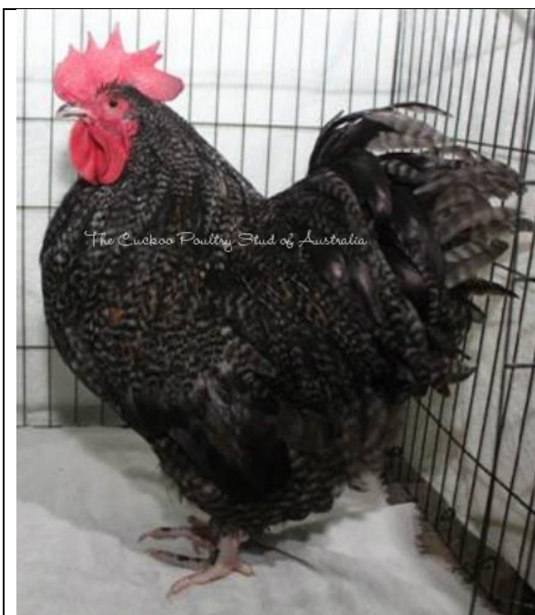
Figure 36 Ch Bantam Cuckoo - The Cuckoo Studs Cockerel