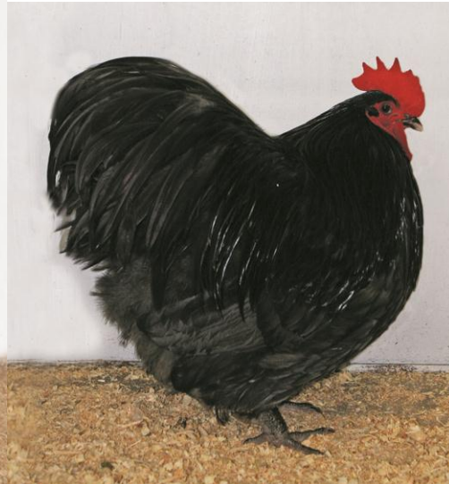
Figure 4 Ch Bantam Blue- Chris Hardman Cockerel