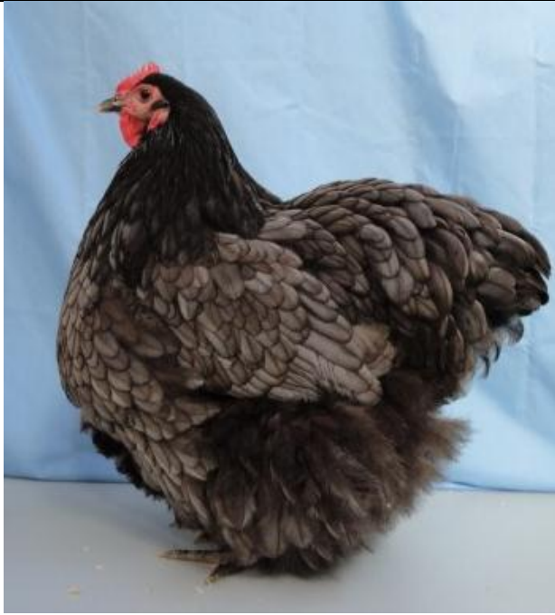
Figure 20 Res Ch Orpington in Show & Ch Large Blue-Denis and Jayne Stannard Pullet