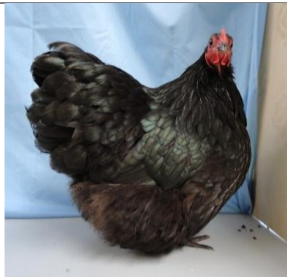
Figure 33 Res Ch Bantam Black- Colin Tiyce Pullet