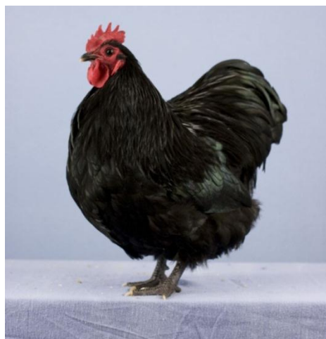
Allan Mortons CH Bantam Orpington Royal Canberra National Poultry Show

The pullets were a nice lot. 1 st and 2 nd were peas in a pod of good type and quality. That they sold at auction for $400 each tells me that someone else thought they were pretty good fowls too! 3 rd was a good bird and 4 th was in the running.