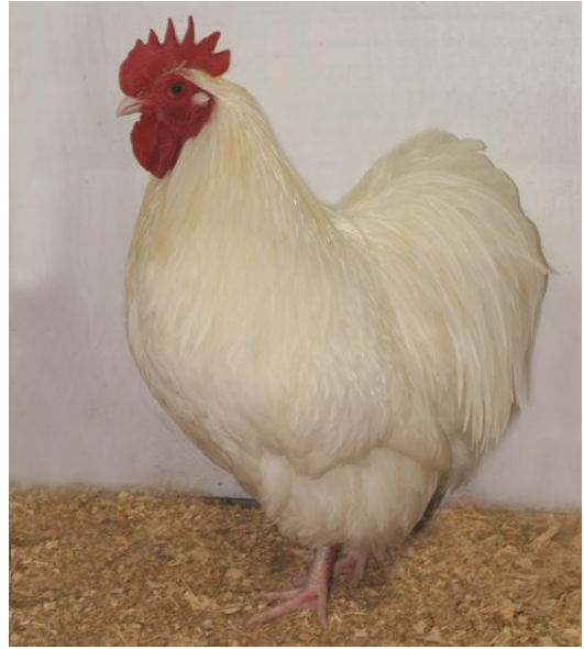
Figure 6 Ch Bantam White- Rob Callinan Cockerel