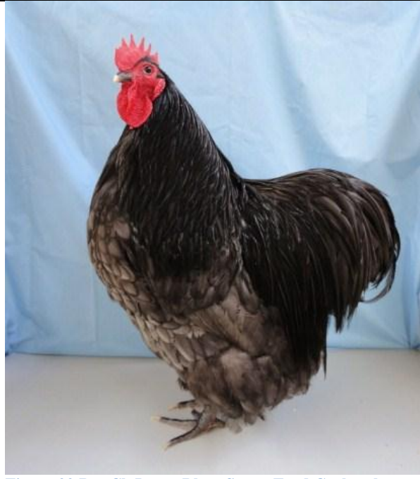
Figure 22 Res Ch Large Blue- Sonya Ford Cockerel