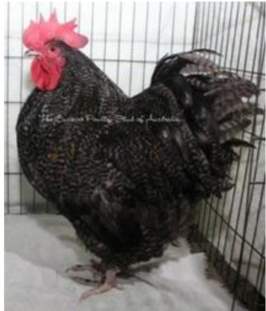
Figure 10 Ch Bantam Cuckoo- The Cuckoo Studs Cockerel