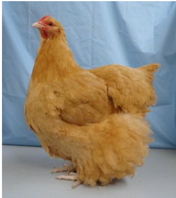
Figure 23 res Ch Large Buff- Goldfeather Poultry Hen