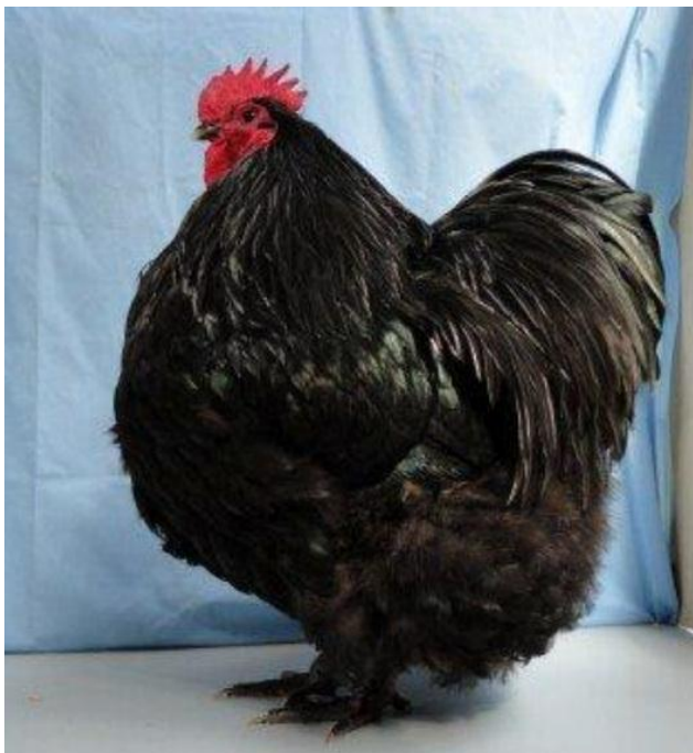
Figure 18 Ch Orpington In Show and Ch Large Black Waninga Orpingtons Cockerel