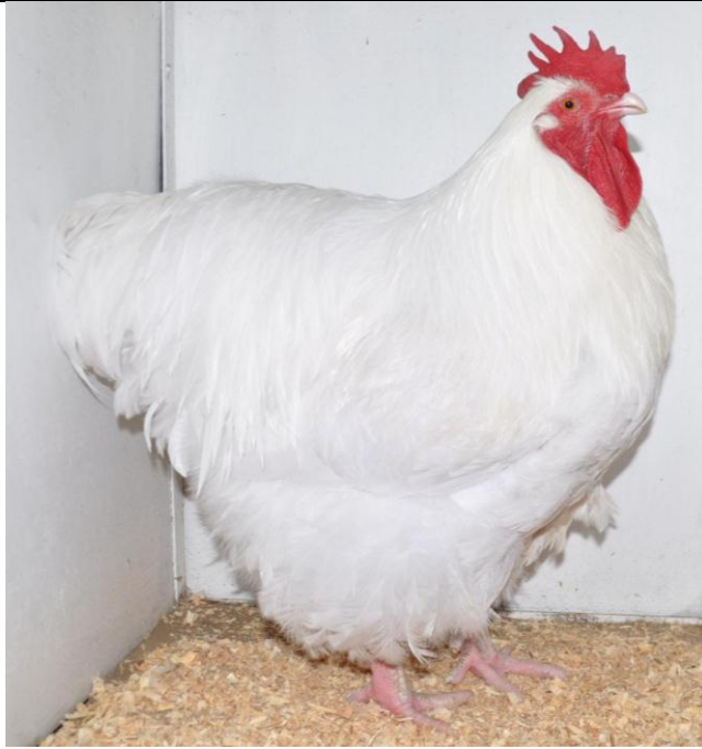
Figure 5 Ch White in Show Ch Large White- Waninga Orpingtons Cock