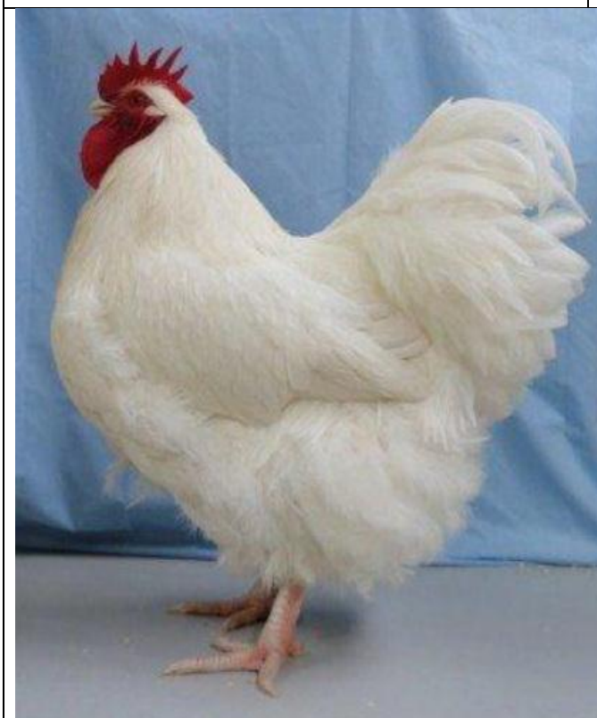
Figure 26 Ch Large White- Waninga Orpingtons Cockerel