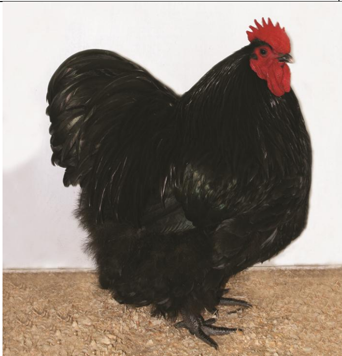
Figure 3 Res Ch Bird in Show & Ch Large Black- Waninga Orpingtons Cockerel