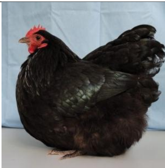
Figure 32 Ch Bantam Black- Bill Patterson Pullet