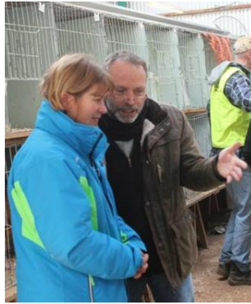
Figure 16 Sharing the knowledge at the Southern Feature

Results- Orpington Club Southern Feature Show held on Saturday 28 th July 2012 in conjunction with the Footscray and District Poultry Club show.