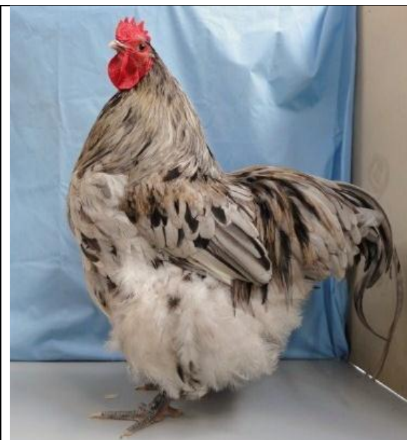
Figure 28 Ch AOC- Rob McLaren Splash Ckl