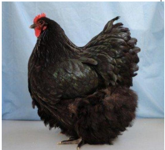
Figure 19 Res Ch Large Black - Waninga Orpingtons Pullet