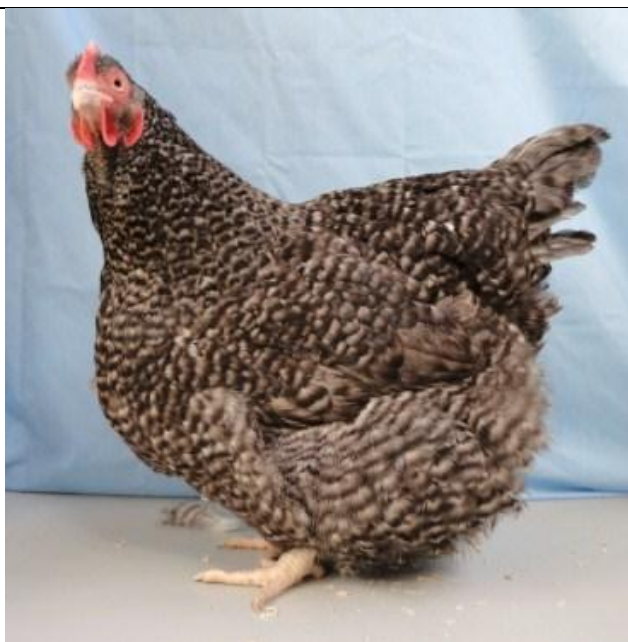
Figure 25 Res Ch Large Cuckoo- The Cuckoo Stud's Hen