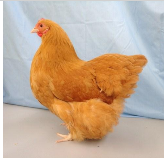
Figure 31 Res Ch Buff Bantam- Royce Keirl Hen