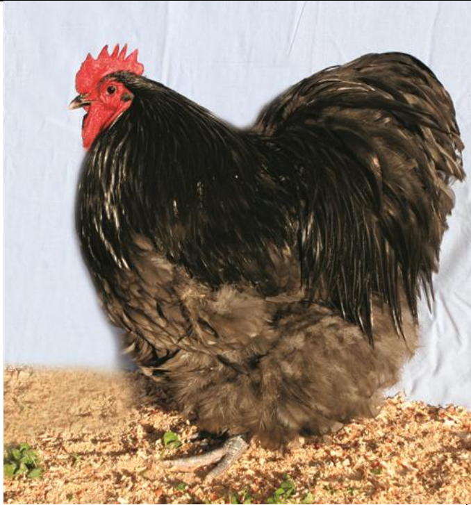
Figure 1 Ch Bird In Show Ch Large Orpington- Chris Hardman Large Blue Cock