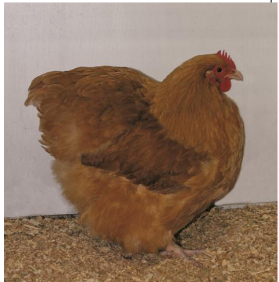
Figure 8 Ch Buff in Show & Ch Buff Bantam- Rob Callinan Hen