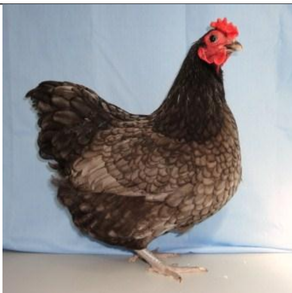
Figure 34 Ch bantam Blue- Rob McLaren Hen