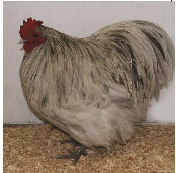
Figure 12 Ch Bantam Splash- Chris Hardman Cockerel