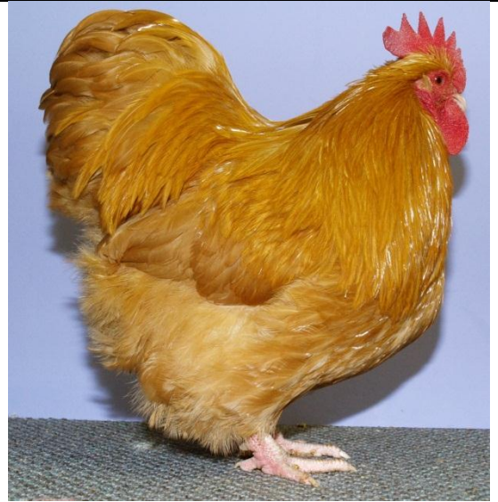
Figure 8 Buff Bantam Ck