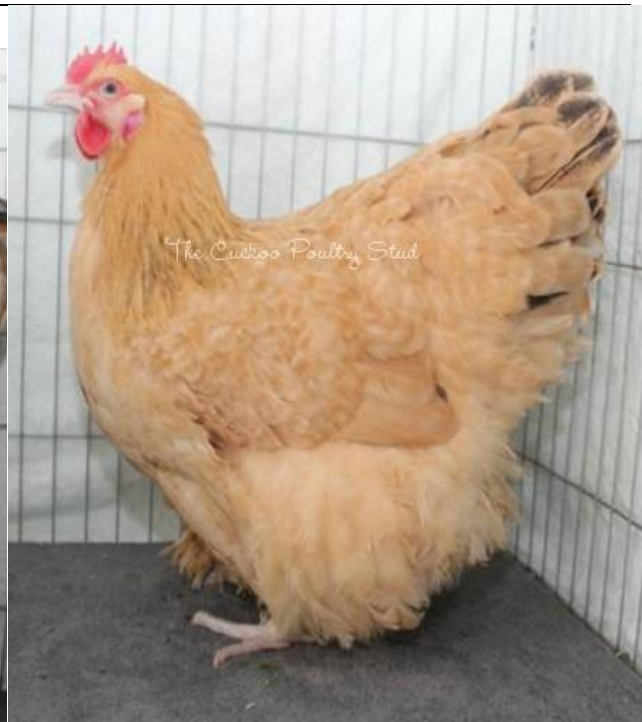
Figure 6 Large Lemon Cuckoo Pullet shown at VR&NBS 2012