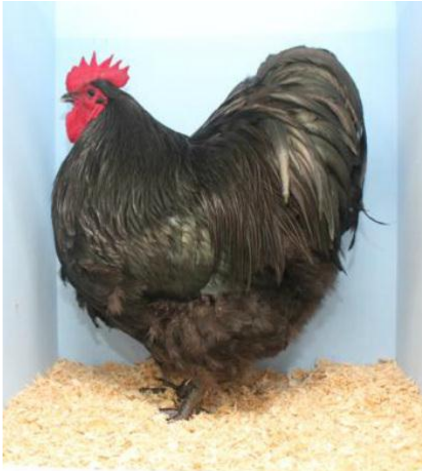
Figure 2 Ch Orpington and Ch Large Soft Feather -Waning Orpingtons Blk Ckl