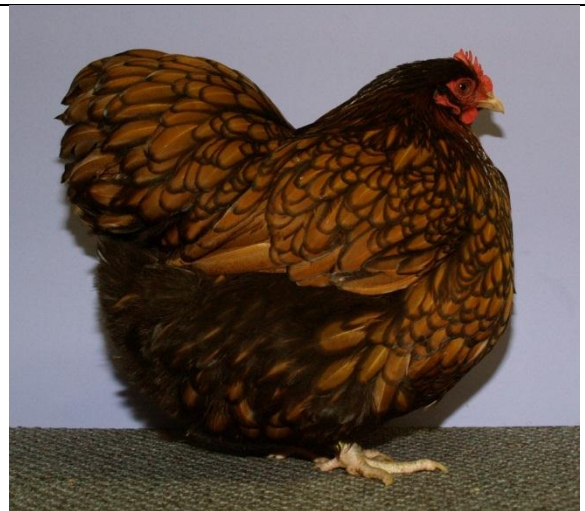
Figure 18 Gold Laced Bantam Hen