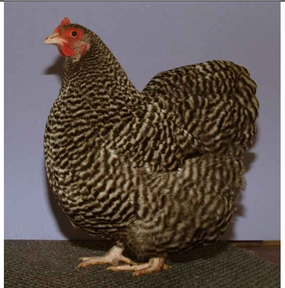
Figure 14 Cuckoo Bantam Hen