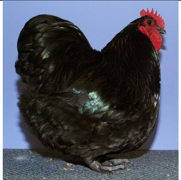
Figure 10 Black Bantam Ckl