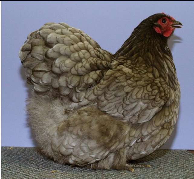
Figure 13 Blue Bantam Hen