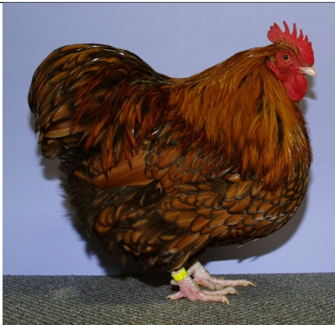
Figure 17 Gold Laced Bantam Ck