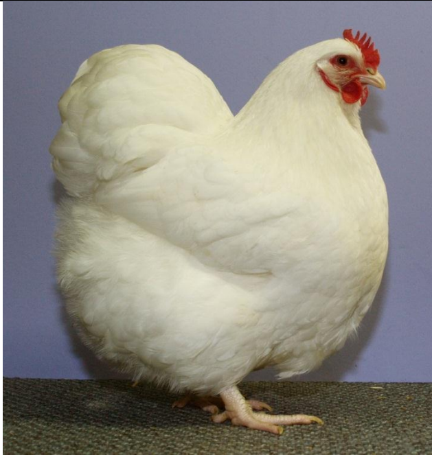
Figure 11 White Bantam Hen