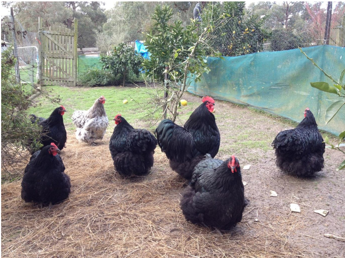
Figure 1 The Secretary's 2012 Large Black breeding Pen

Best contact is via Email secretary@orpingtonaustralia.com