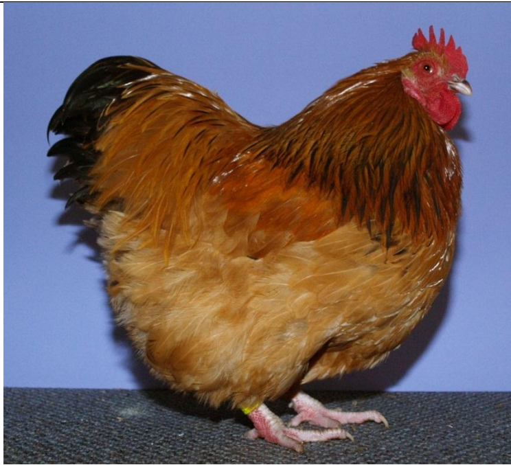
Figure 15 Buff Columbian Bantam Ck