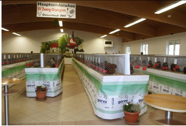
Figure 7 The Show Hall @HSS Orpington Show in 2011. Featuring some world class Bantam Orpingtons! More pics to follow but for now just a few tasters- Thanks to Bent Neilson for these information and photography