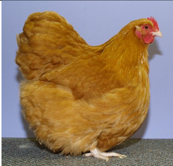
Figure 9 Buff Bantam Hen