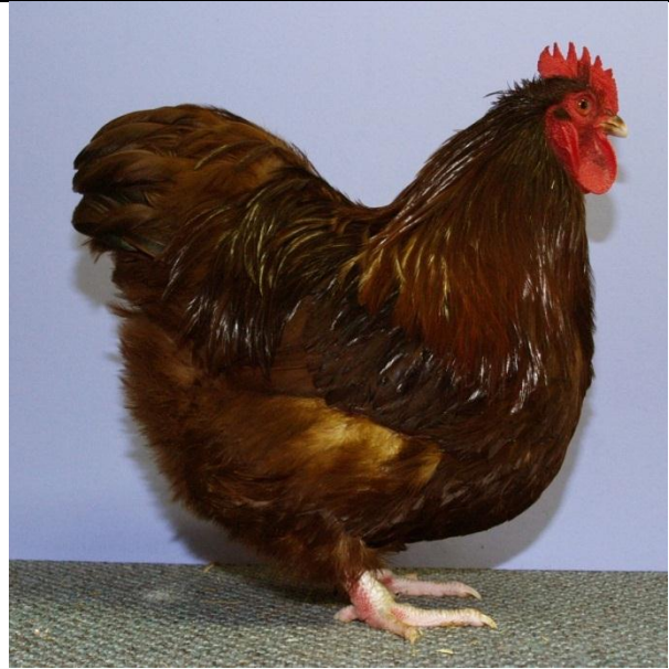
Figure 12 Red Bantam Ck