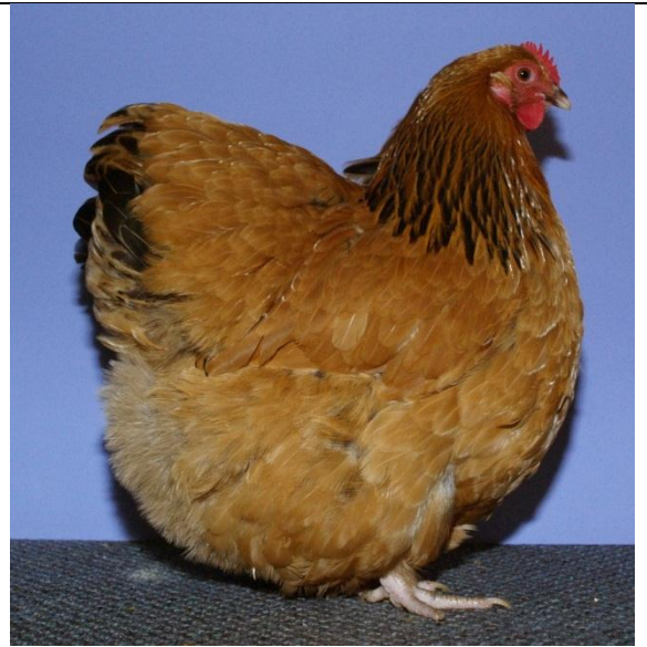
Figure 16 Buff Columbian Bantam Hen