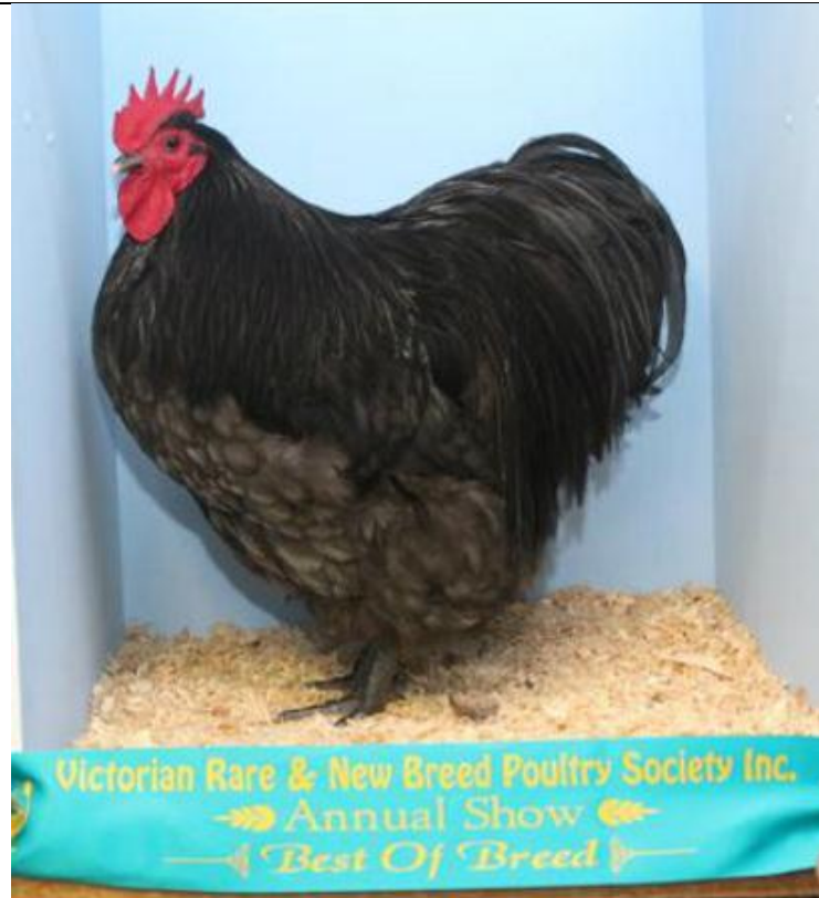
Figure 3 Ch Large Blue and Res Ch Large Softfeather Sonya Fords Blue Ckl