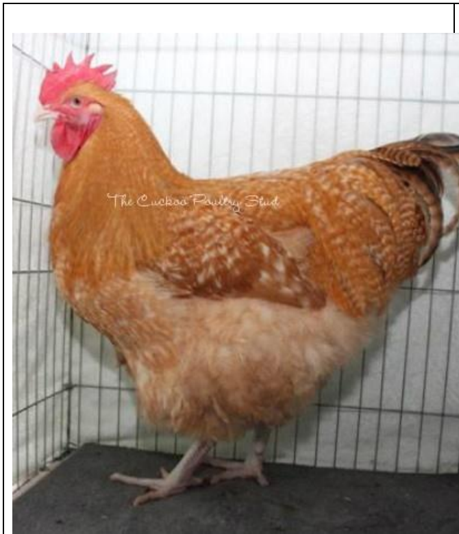
Figure 5 Large Lemon Cuckoo Ck shown at VR&NBS 2012