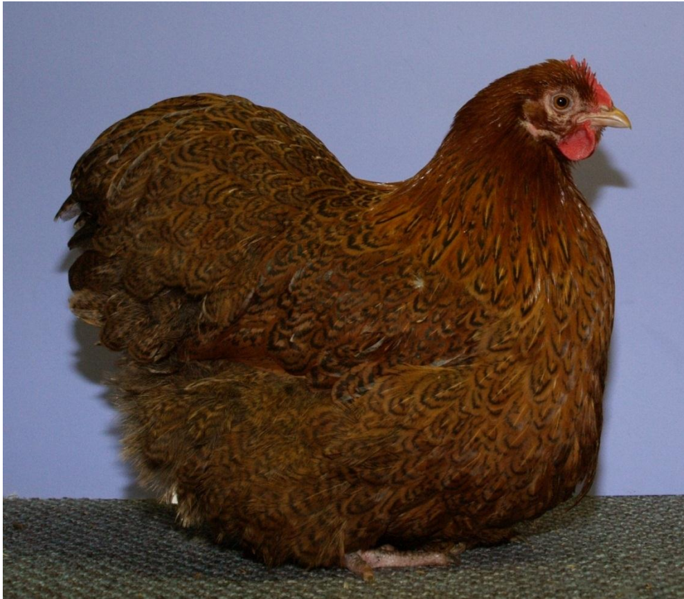
Figure 4 European Bantam Partridge Hen