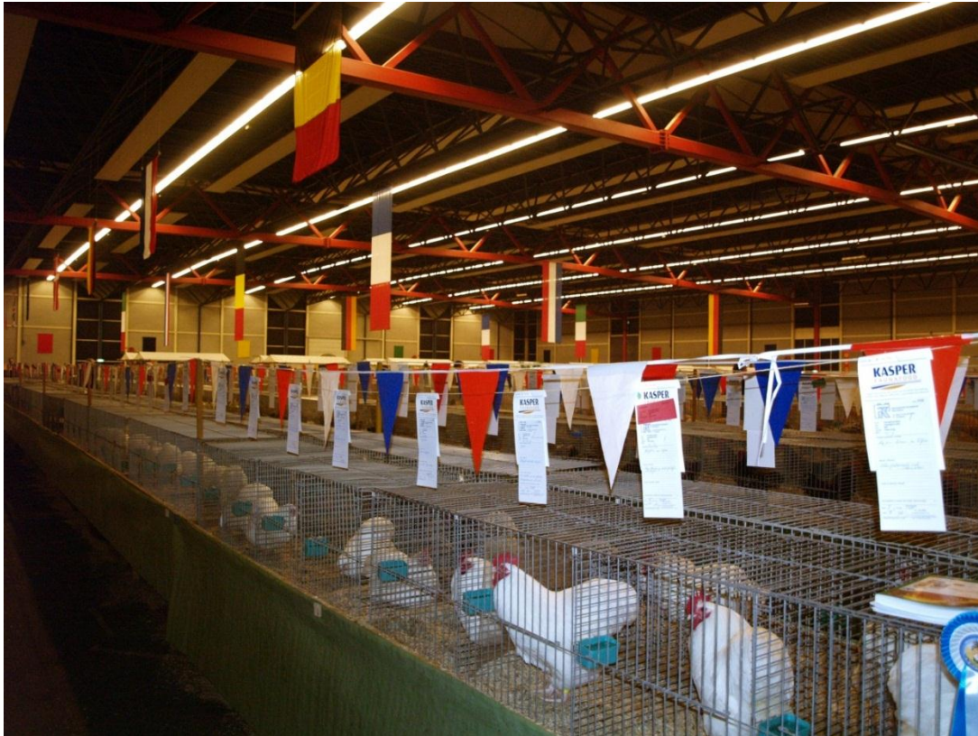
Figure 19 A grand Line Up of White Orpington bantams ( Zuidlaren Show 2012)